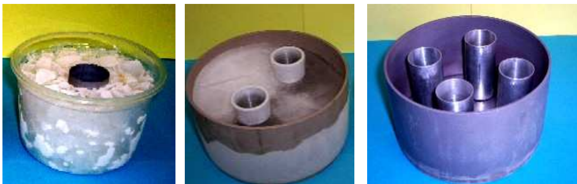
a – C1