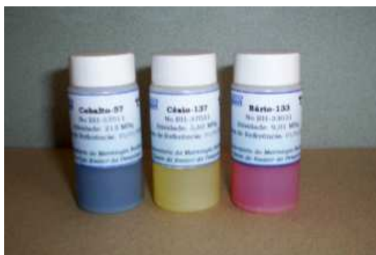
Figure 1. Water equivalent sources of ^{57}\text{Co} , ^{137}\text{Cs} and ^{133}\text{Ba} .

The sources have been prepared with ^{57}\text{Co} , ^{137}\text{Cs} and ^{133}\text{Ba} radioactive solutions. The final activity of the sources is: 185 MBq, 9.3 MBq and 5.4 MBq, respectively, Fig. 1. These sources are suitable for performing constancy and accuracy tests, mainly for Medical Radionuclide Calibrators. The sources have density similar to water and good uniformity. In this paper, the study of parameters involved in the procedure to improve the preparation method is presented.