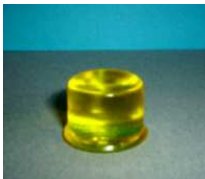
Figure 3. Polymerized acrylamide resin source used for the determination of the uniformity and of the density

The uniformity of the resin was obtained measuring the activity of pieces of polymerized resin in an HPGe spectrometer, previously calibrated with IAEA standard sources of ^{152}\text{Eu} , ^{133}\text{Ba} and ^{137}\text{Cs} . Fig. 3 shows the source obtained in polymerized acrylamide resin before the cutting process. It has a soft and rubbery texture. The density value was determined by measuring mass and volume of each resin and the average density obtained was (1.06 \pm 0.02) \text{ g cm}^{-3} .