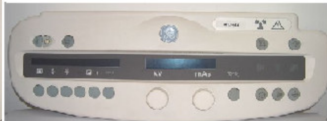
Figure 1: Mammography X-ray equipment model Senographe 700T (GE).

The calibration factor for this voltage divider was determined using a method described in [7] and it used a value of the bremsstrahlung spectrum to obtain the average peak voltage. The figure 2 show the calibration curve to determined the rasion between the voltage from the display of the equipment and the voltage from the spectrum bremsstrahlung.