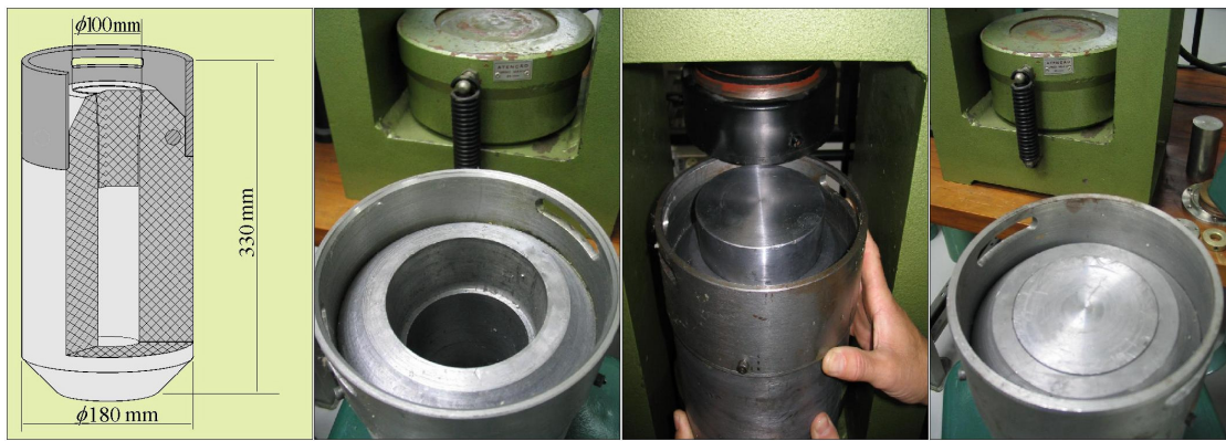
Fig. 2. Disposal package: a) cut view with dimensions; b) top view without the stopper; c) just before being sealed in a hydraulic press; d) a smooth top surface is left after stopper is inserted.

The space between the casing and the containers is left void, without grouting, first because lead would be corroded by the calcium hydroxide present in Portland cement materials and, on the other hand, the repository can function as a retrievable storage until it is sealed off. Retrievability is a controversial question but the concept is flexible allowing both conditions: in the form it is presented here, it is a retrievable storage; small changes in the design of the disposal package can render the wastes almost irretrievable.