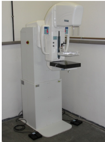
Figure 1: VMI Graph Mammo AF Phillips

In this study were used the VMI Graph Mammo AF Phillips, who operates in the range 20 to 35 kilovolts (kV), has target of Molybdenum (Mo) and inherent filter Rhodium (Rh) and Molybdenum.