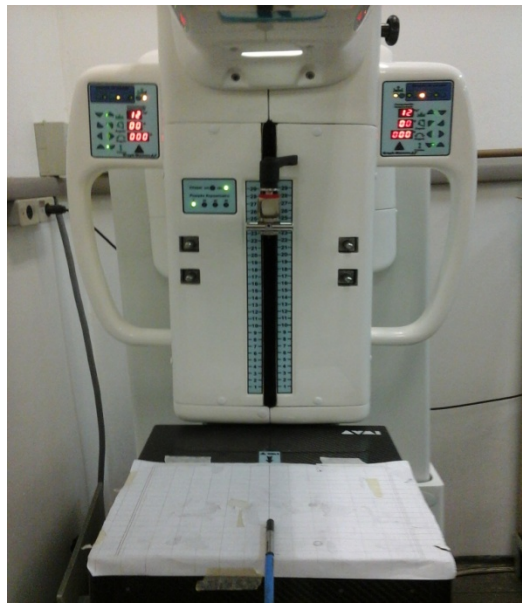
Figure 3: The ionization chamber was placed on the breast support at the point of maximum beam

The ionization chamber was placed on the breast support at the point of maximum beam previously determined by Correa et al [3] to be at 50mm from the outer edge of the breast support in the center thereof.