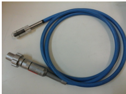
Figure 2: Ionization chamber PTW 31013

To perform the measurements, were used the electrometer PTW Unidos E, coupled to the ionization chamber PTW 31013, with a sensitive volume of 0.3 cm 3 , with measurement on the greatness of picocoulombs (pC).