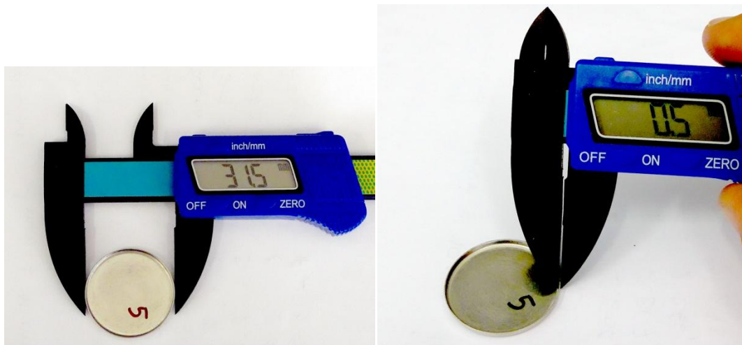
Figure 1: A typical stainless steel sample holder used in LAN-IPEN.

In the Neutron Activation Laboratory of IPEN-CNEN/SP (LAN), the samples are usually irradiated inside polyethylene bags, which are essentially transparent to gamma radiation of any energy. However, as the bags themselves may become radioactive after the irradiation, the irradiated sample bags have to be then placed inside some container, to avoid contamination and seal the radioactive sample. The procedure, then, consists in placing the irradiated sample bags over a thin (~0.5mm thick) stainless steel disc, shown in Fig. 1, and then cover the sample with adhesive tape.