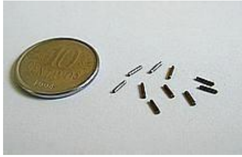
Figure 1: Photo of the seeds.