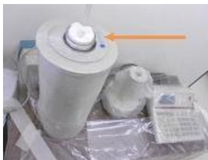
Figure 4: Capintec15W. Emphasis on sample holder for the measures.