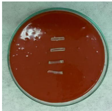
Figure 3: Pellets removed after the resin curing process.

The epoxy resin was mixed with the radioactive solution and placed in a silicone mold. In this assay, 10 mL (11.2 g) resin (Epichlorohydrin reaction with Bisphenol A) was mixed with 20% hardener (modified polyethylene diethylenetriamine-DETA, used in all experiments) 2.04 mL (2.24 g), totaling a mass of 13.4 g of solution. The template contains four spaces in which the solution was placed. These spaces have the dimensions of the seeds. After the resin curing process the four pellets were removed (Fig.3) and taken to a Capintec CRC-15W ionization chamber (Fig. 4), to measure the activities one by one. Each core was measured three times and averaged as shown in Table 1.