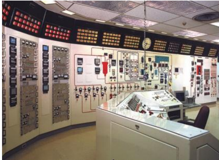
Figure 2: High Flow Isotope Reactor control room, used to make Plutonium-238 in Oak Ridge. Source: [2].

In a proposal to complement the production of Plutonium-238 for NASA, a public-private partnership led by Technical Solutions Management (TSM) presented in 2017 a project for radioisotope production using a DOE-like production line: the DOE Pacific Northwest National Laboratory (PNNL) supplies Neptunium-237, which is sent to the Chalk River Laboratories of the Canadian Nuclear Laboratories (CNL), where the packages are assembled for the reactor. Afterwards, these packages are sent to the Ontario Power Generation (OPG) Darlington reactor for irradiation, generating Plutonium-238, which is then transported back to the CNL for the chemical processes. The next stage of the project is dependent on funding [10].