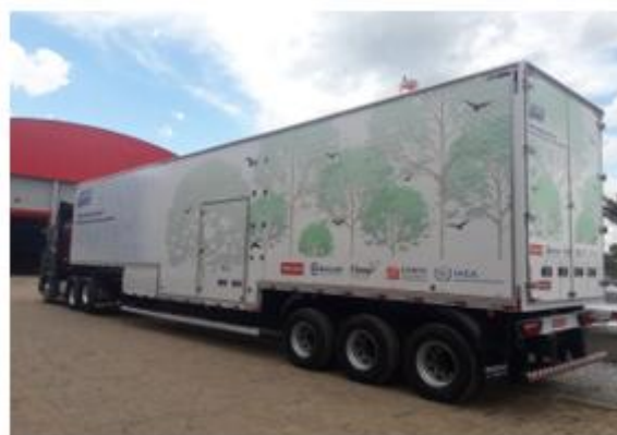
Fig. 5. Mobile Unit (0.7 MeV and 20 kW) developed by IPEN-CNEN.

The mobile electron beam accelerator for the treatment of wastewater and industrial effluents is shown in Figure 5.