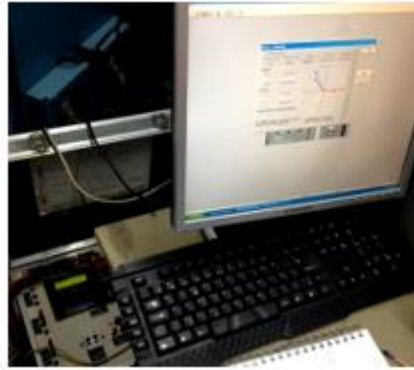
Fig. 1. Power quality meter used to measure harmonic levels of an EBA.

The non-linearity characteristic of the current and the voltage waveforms were verified, as well as the harmonic distortion of a similar industrial electron accelerator model RDI DC 1500/25/4 (1.5 MeV and 37.5 kW). The distortion levels obtained were compared with normative limits, where it was noticed an overcoming in all operation ranges. In Table 2, it is shown, in bold, the current harmonic distortion for the EBA, at nominal conditions (1.5 MeV and 15 mA).