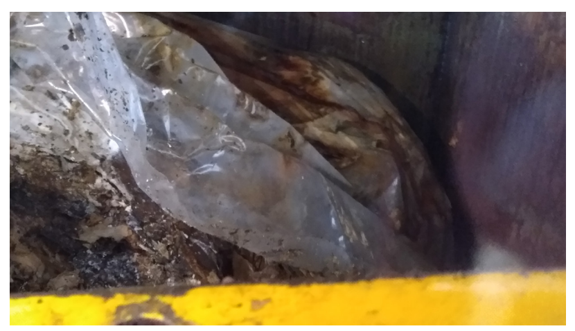
Figure 3 - The paper bale collapsed, reducing the volume by about 30% of the original height. By the touch, the mass appears like moist clay.