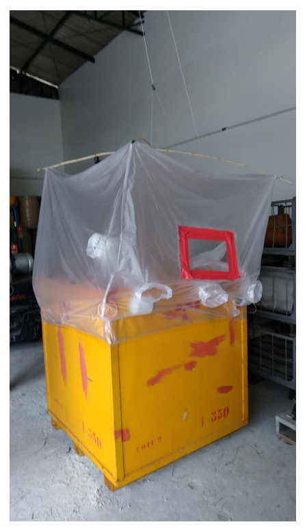
Figure 1 - Plastic cap over the waste box.

The cover allows samples to be taken from the box without the risk of contamination of the air or surrounding surfaces. Gloves were installed on the front and lateral sides of the cover to allow unscrew the bolts and lift the lid. An acrylic plate was added to the front of the cover for better visual inspection. Such actions aimed at ensuring the environment was kept clean and safe.