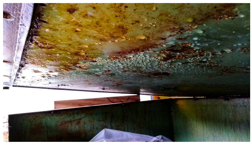
Figure 2 - Inside of the box that showed the highest moisture content. Note the water droplets formed by condensation in the underside of the box lid.

After opening three boxes, the presence of high moisture content was observed (Figure 2), as well as a marked reduction in paper volume of the order of 10 to 30% (Figure 3).