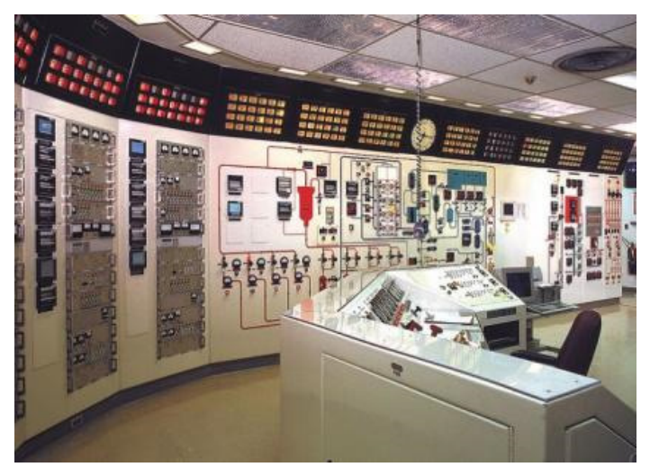
Figure 2 - High Flow Isotope Reactor control room, used to make Plutonium-238 in Oak Ridge.

The neptunium is then sent to the Oak Ridge National Laboratory (ORNL), where it is compressed into pellets in the shape and size of a pencil eraser. The pellets are then fitted one by one into long aluminum tubes, and taken to one of the lab's most historic buildings: High-Flow Isotope Reactor, the site of the largest neutron flux in the Western Hemisphere for more than 50 years (Figure 2). There is a 2.4-meter diameter beryllium cylinder with dozens of holes where the aluminum tubes with the pellets are inserted. In this way, they are fully exposed to the reactor core. After the insertion of the tubes, the entire assembly is taken into a pool, and the reactor is then turned on for 25 days. In this period, Neptunium-237 is bombarded