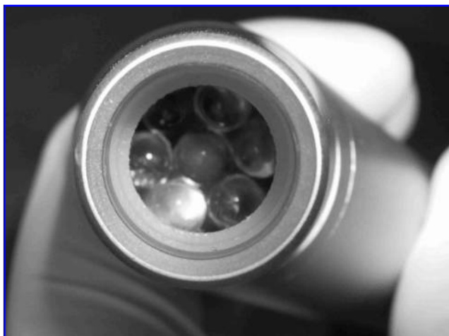
FIG. 1. Handpiece with seven LEDs.

To check the results, the irradiated areas were photographed. A trained examiner evaluated the photos to establish the degree of severity of the mucositis in accordance with the World Health Organization (WHO) 21 scale. Pictures were taken after each chemotherapy cycle, for both 5-day phases, on days 1, 3, 7, 10, and 13. With regard to pain as-